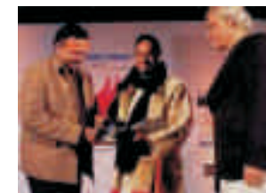
Receiving BW-NID Design Excellence Award 2005 for Best Retail Packaging